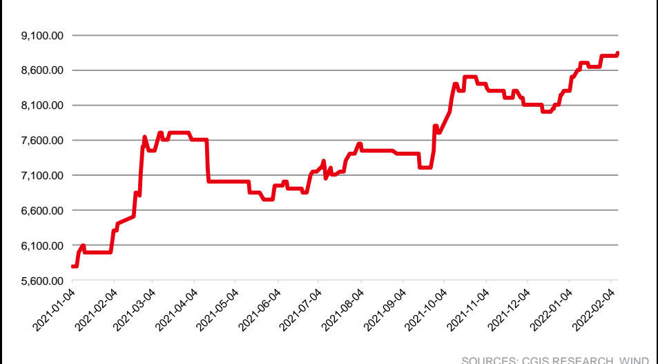
Figure 3: China PET market price (Rmb/ton)