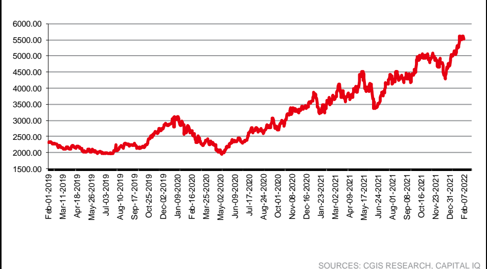
Figure 2: Palm oil price (MYR per MT)