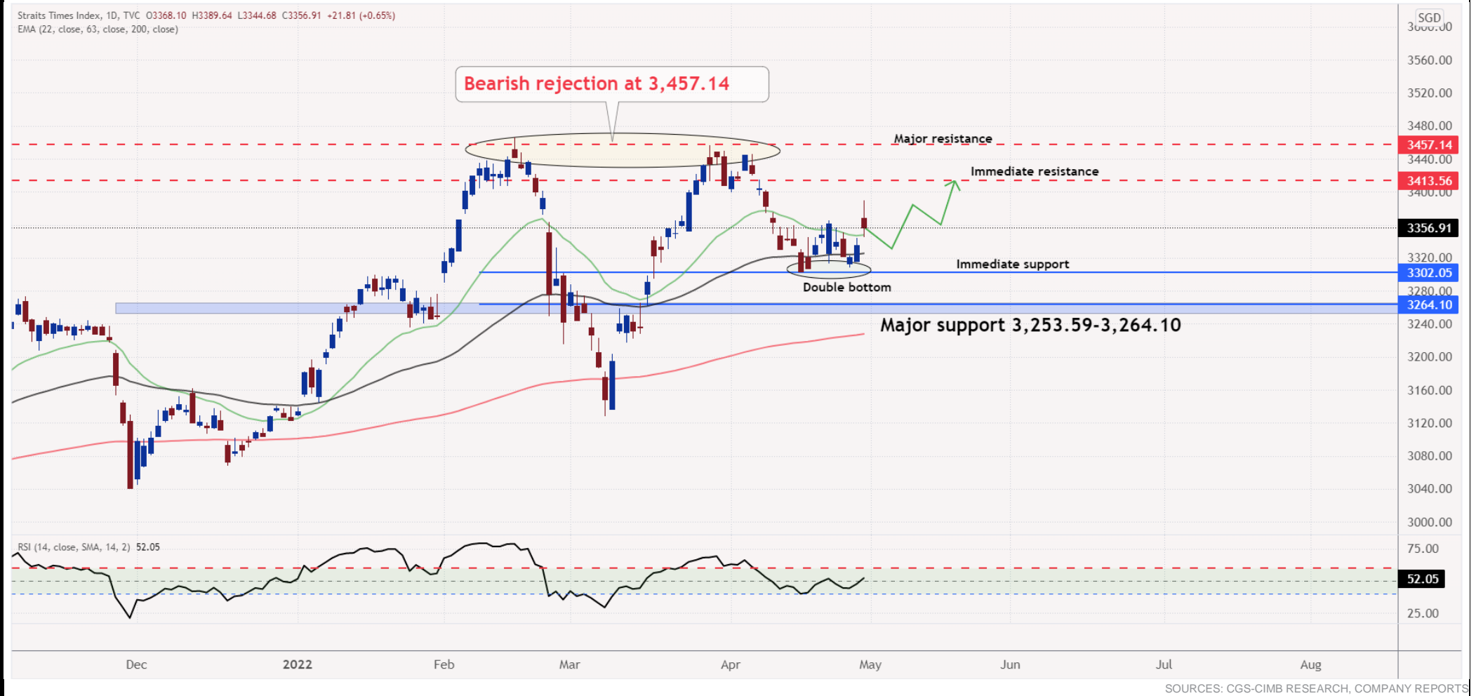
Figure 1: FSSTI daily timeframe – Sideways trend expected